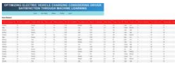
Fig 6.2: Load And Preprocess Dataset