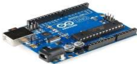
Fig 3. Arduino Uno Board

In order to create digital devices and interactive objects that can sense and control both physically and digitally, Arduino is an open-source hardware and software company, project, and user community that designs and manufactures single-board microcontrollers and microcontroller kits. Anyone can build Arduino boards and distribute its software thanks to its products' GNU Lesser General Public License (LGPL) or GNU General Public License (GPL) licenses.