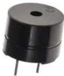
Fig 8. BUZZER

Something that vibrates or buzzes is called a buzzer. In most cases, an electronic component is utilized to provide an audible signal or alert for a variety of purposes.