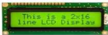
Fig 7. LCD

LCD is an electronic display module and has a wide range of applications. A 16X2 LCD display is very basic module and is very commonly used in various devices and circuits. A 16X2 LCD means it can display 16 characters per line and there are 2 such lines.