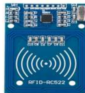
Fig 5. RFID READER

RFID stand for Radio-Frequency identification. It refers to a technology, where digital data is encoded in RFID tags and decoding by an RFID reader using radio waves. RFID is similar to barcoding in which data from a tag is decoded by an RFID reader device. The RFID technology is used in various applications like inventory management, attendance system, door lock system, access to restricted areas, etc.