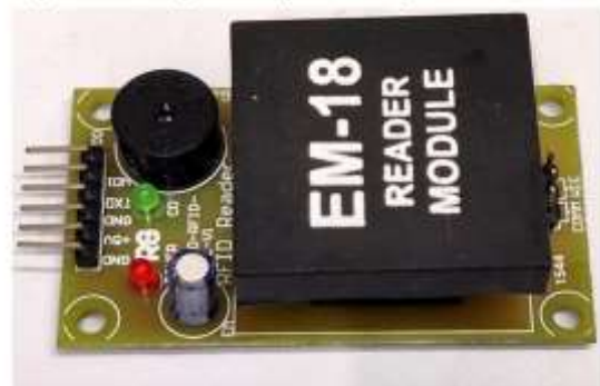
Fig 4. RFID READER MODULE

the unique identification number stored in the card. This data is then transmitted to a central processing system, which verifies the passenger's credentials, deducts the appropriate fare from their account, and grants access. The process is contactless, quick, and efficient, reducing congestion and improving overall commuter experience. Additionally, RFID readers can store transaction logs and help in monitoring travel patterns, enhancing both security and service optimization in the metro network.