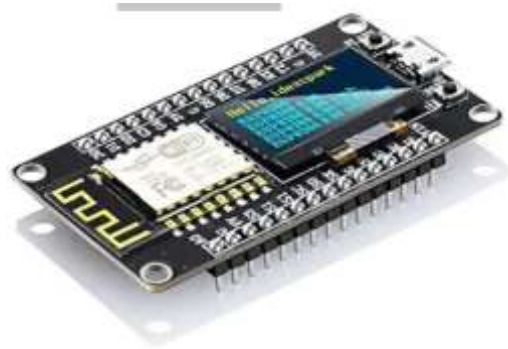
Fig 8. ESP8266